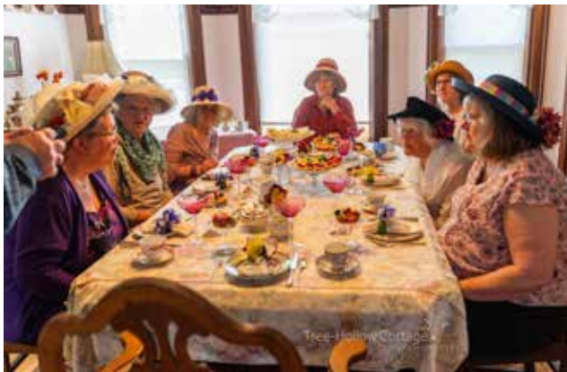
Some of these ladies borrowed Larson House hats for their afternoon tea.