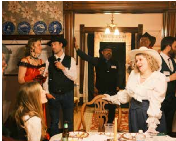
This murder mystery held at the Larson House had a western theme.