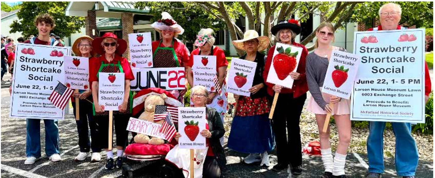
These fun people marched in the McFarland Memorial Day Parade to promote the Strawberry Shortcake Social.

The committee is hopeful that this year we will be able to host the Strawberry Shortcake Social at the Larson House. This way, guests can enjoy our delicious dessert, walk through the lovely interior of this house museum, view the colorful flower gardens surrounding the house and listen to some outstanding live music. The event is scheduled for June 28, 2026, from 1-5 pm. Mark your calendar!