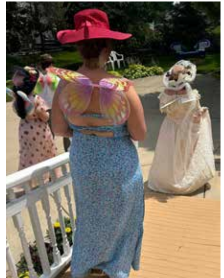
This group of ladies had a fun bridal shower with a tea and fairy theme.