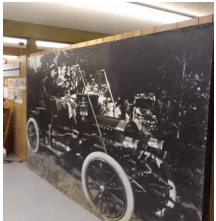
One of the new displays at the museum is a life size picture of a 1914 Maxwell automobile.