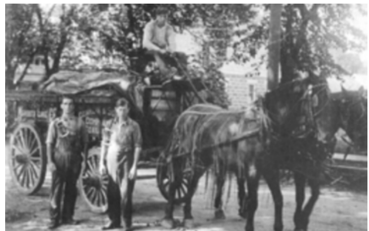
Hauling ice in Madison in the early 1900's. The ice was cut on the Four Lakes, stored in ice houses insulated with sawdust, and the "ice man" would bring blocks of ice to homes and businesses.