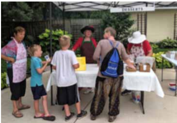
The dessert table.