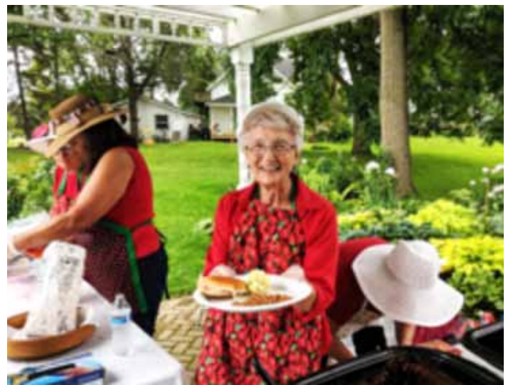
Serving lunch .