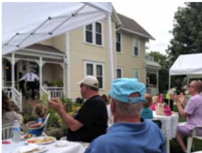
The crowd clapping after one of the performances at the picnic.